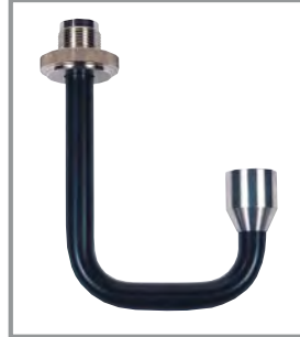
FIG 24 VACUUM ADAPTOR

Stainless steel adaptors available in various sizes of Metric, BSP and NPT thread. Dual gauge stand for simultaneous calibration of two instruments.