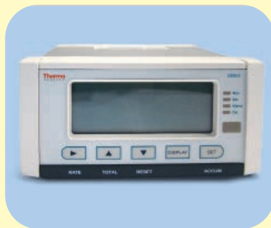
Thermo Scientific Sarasota CM515