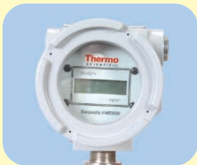
Thermo Scientific Sarasota HME900